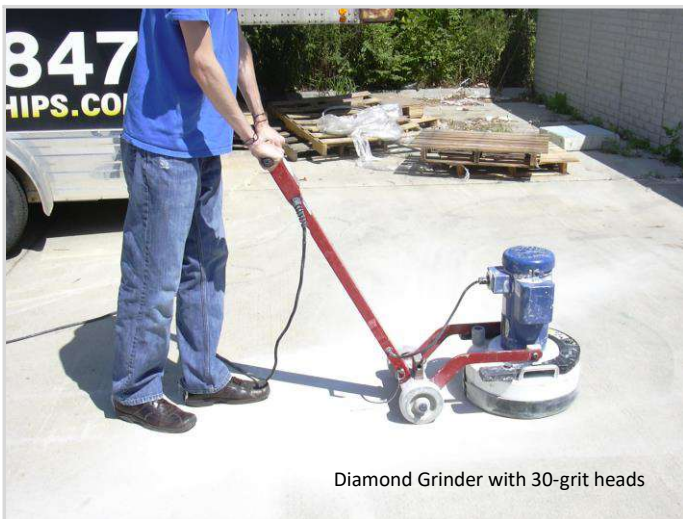
Diamond Grinder with 30-grit heads

SURFACE PREPARATION: Concrete Surfaces: All surfaces must be sound, dry, clean and free of oil, grease, dirt, mildew, form release agents, curing compounds, efflorescence, loose and flaking paint and other foreign substances prior to applying your first coating. The floor should be as level as possible. Remove laitance and roughen unusually slick poured or precast concrete as well any oil, grease, and dirt by using mechanical means (diamond grinding is preferred).