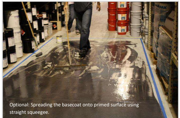
Optional: Spreading the basecoat onto primed surface using straight squeegee.

If you are using a roller to apply the Pure Metallic basecoat, you will need to roll fairly aggressively to move the material around. After the basecoat has been evenly dispersed, gently backroll the entire wet area with your roller (3/8" nap) in one direction to further promote even coverage.