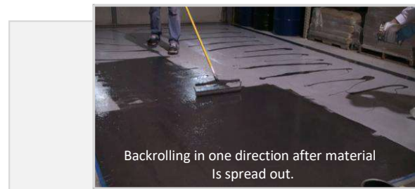
Backrolling in one direction after material is spread out.

For best results you want to apply the effects immediately after the section is rolled out.