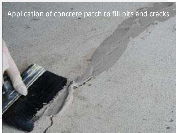
Application of concrete patch to fill pits and cracks

PATCHING: Patching pits and divots is the first step of the process. Remove loose aggregate and repair voids.