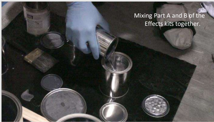
Mixing Part A and B of the Effects kits together.