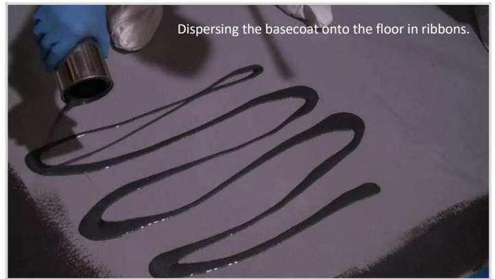
Dispensing the basecoat onto the floor in ribbons.

If you are using a roller to apply the Pure Metallic basecoat, you will need to roll fairly aggressively to move the material around. After the basecoat has been evenly dispersed, gently backroll the entire wet area with your roller (3/8" nap) in one direction to further promote even coverage.