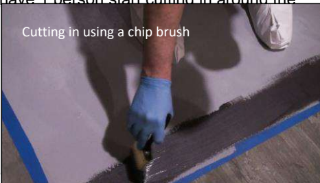
Cutting in using a chip brush

Since Pure Metallic epoxy has a 30 minute pot life, and it may take you longer than that to "cut.in" around the edges of the floor, we recommend having at least 3 people to assist with all aspects of the Pure Metallic application. 1 person to mix material, 1 person to roll out the basecoat and cut in, and 1 person to apply the effects. Mix part A and B together thoroughly. (Mix Ratio 2 parts A, to 1 part B) Remember: Once mixed, you must get the material out of the can in 30 minutes or less, otherwise it will harden. We recommend pouring out a small portion of the basecoat kit around the edges of the 200 square foot section you will be covering, and then pour the rest of the material on to the floor in ribbons making sure not to pour it outside of the 200 sq/ft section you will be coating. Once the material is out of the can completely you can have 1 person start cutting in around the edges.