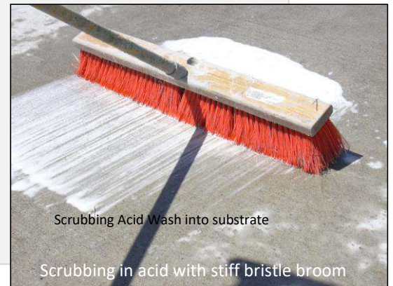
Scrubbing Acid Wash into substrate

Begin by diluting the etching solution with water (mix 1 gallon of solution with 1 gallon of water). Pour onto surface and scrub into the pores of the concrete with a stiff bristle broom.